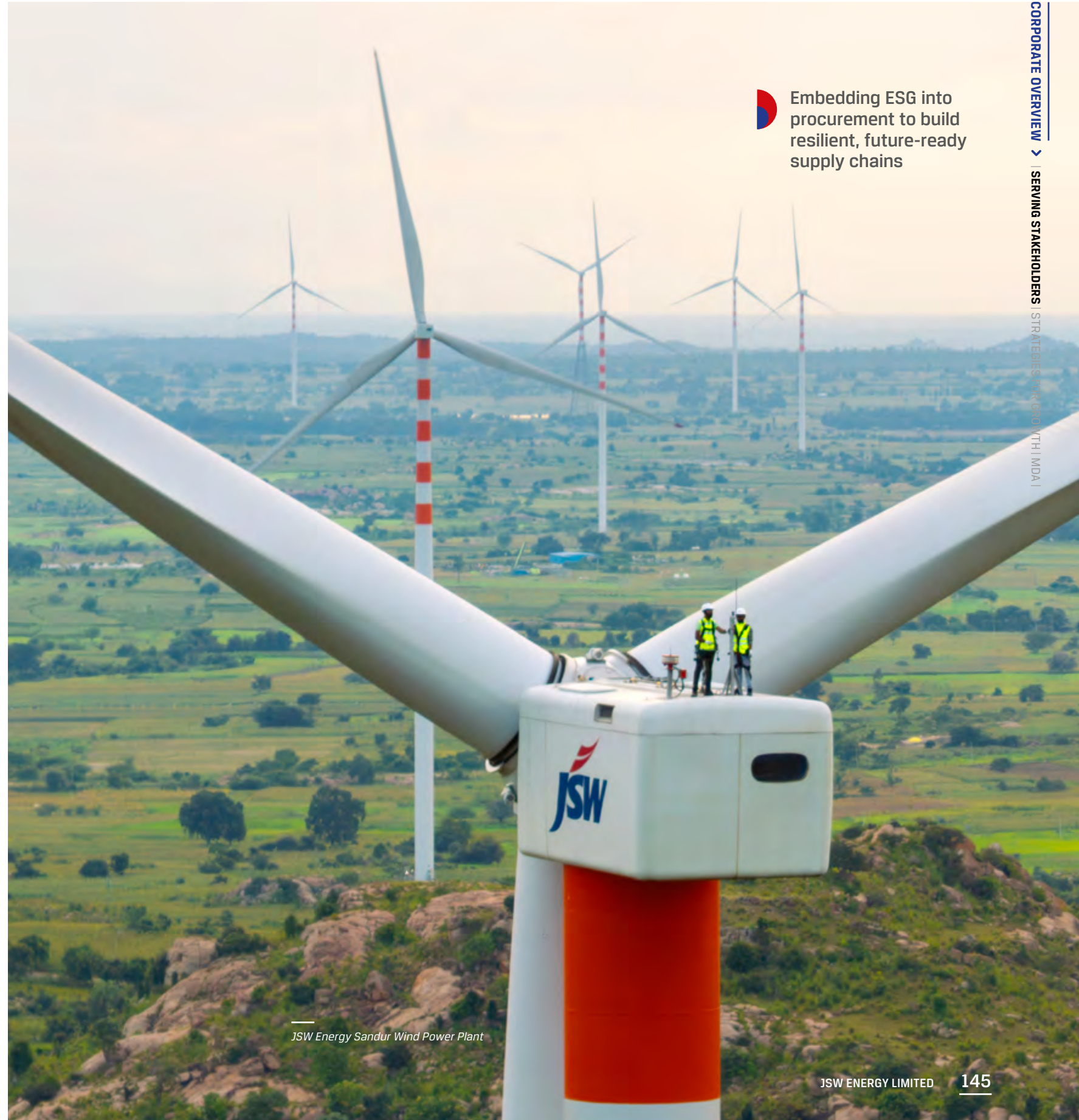
JSW Energy Sandur Wind Power Plant