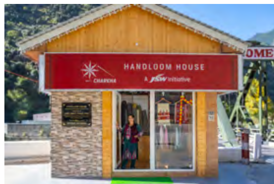
CHARKHA Handloom House

Houses under Charkha boasts infrastructure such as vocational training centre-cum-production centre, Charkha Stitching House, Charkha Laundry House (finishing centre) and Handloom House, among others. Additionally, the project empowers women by showcasing the products made by them in the exhibition.