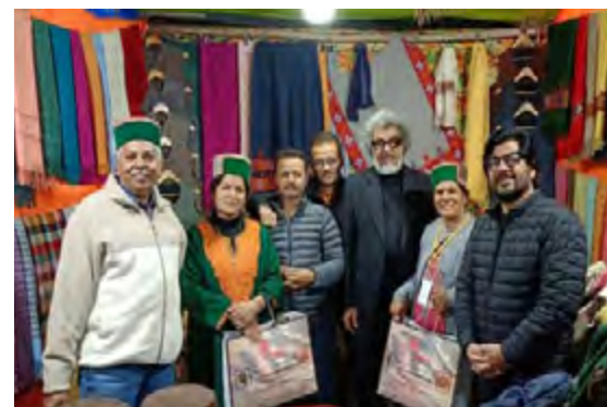
Exhibition of Charkha Products at Kalagram, Chandigarh