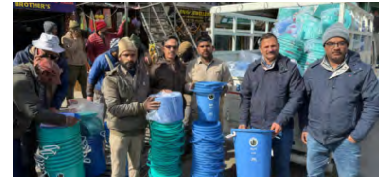
Waste Management drive of distribution of colour coded dustbins at JSW Energy- hydro plant