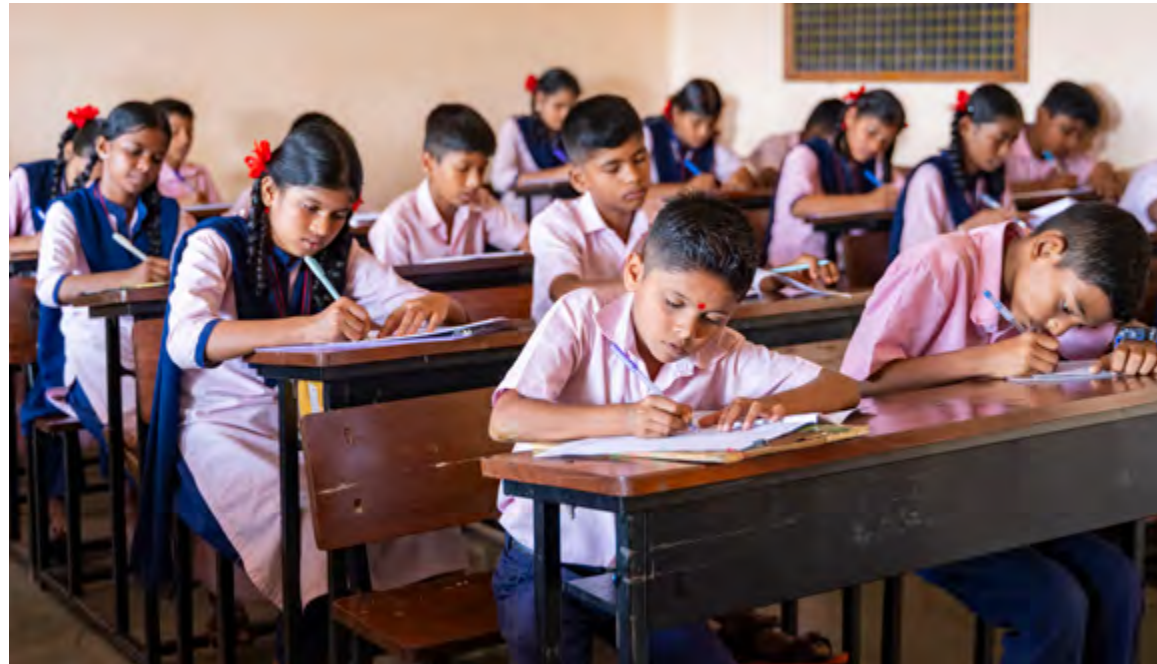
JSW Energy Ratnagiri Power Plant