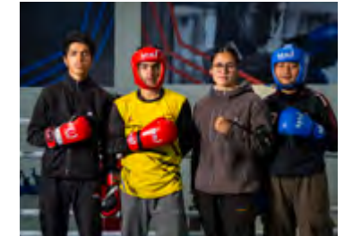
Boxing training sessions in 04 SHIKHAR Centres